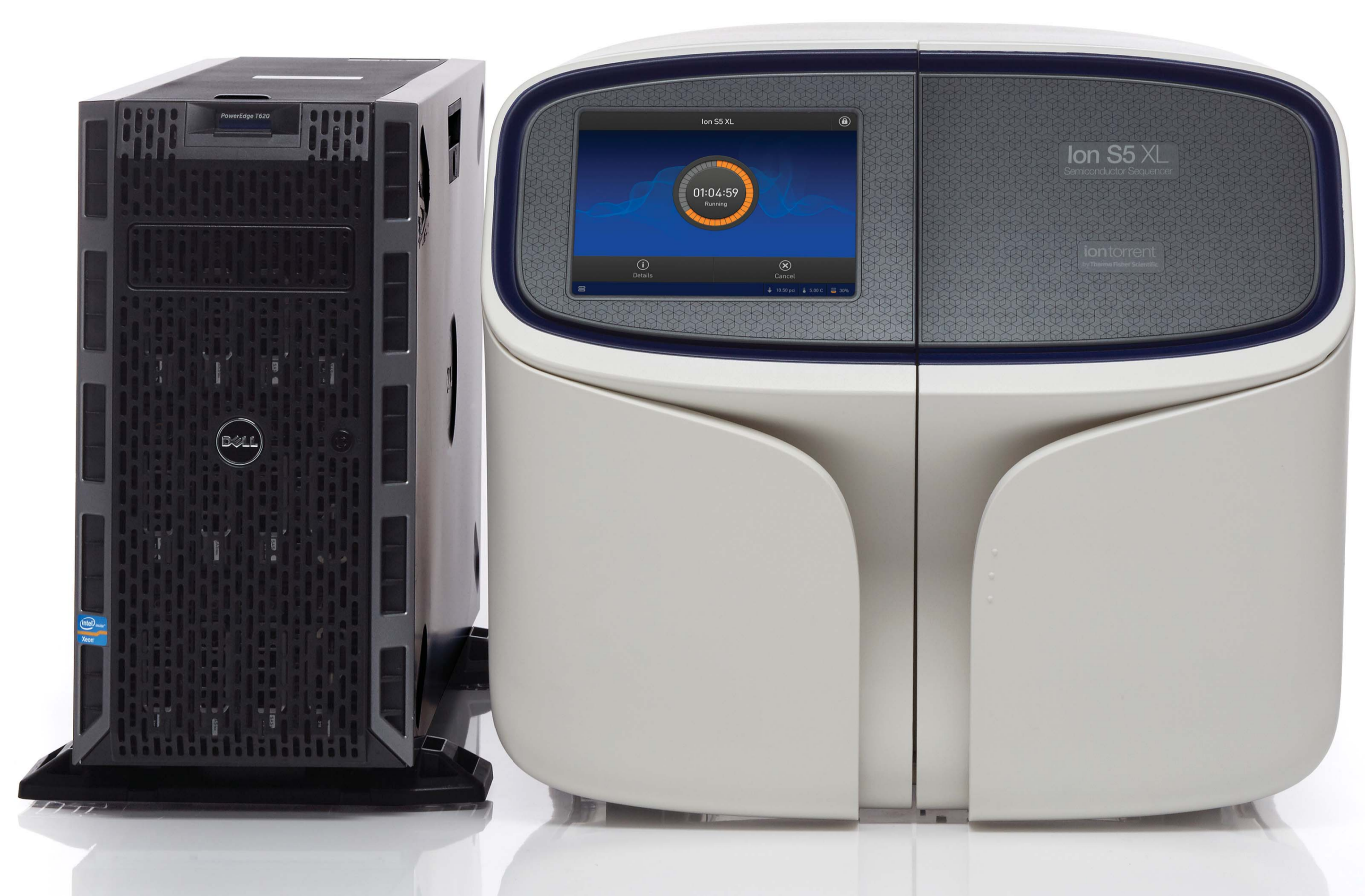
Ion S5 Systems